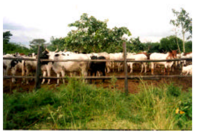
Krall in the Reserve: The new wildlife?